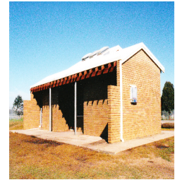
Graffiti removed from brickwork & doors