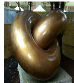
Monuments requiring Delicate Surface restoration