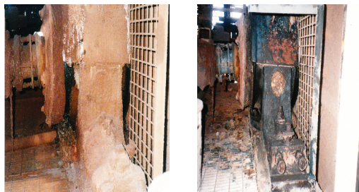
Ball Mill cleaned & repainted one step